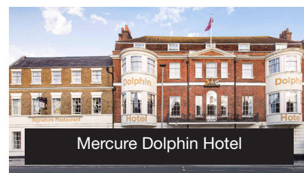
Mercure Dolphin Hotel