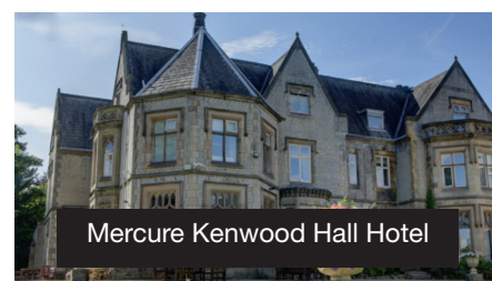
Mercure Kenwood Hall Hotel