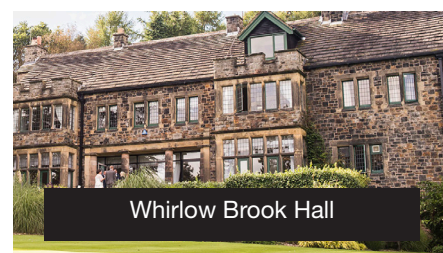
Whirlow Brook Hall